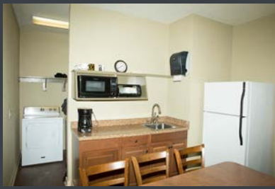
Newly Constructed NRS Training Center Apartment