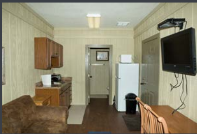
Newly Remodeled NRS Training Center Apartment