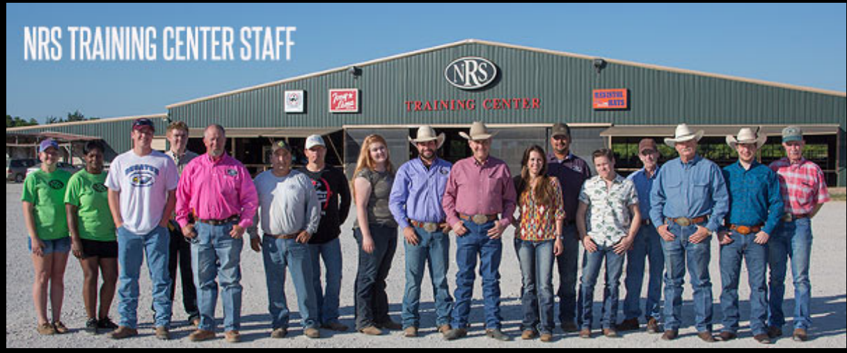
NRS TRAINING CENTER STAFF

Newly Constructed NRS Training Center Employee Break Room